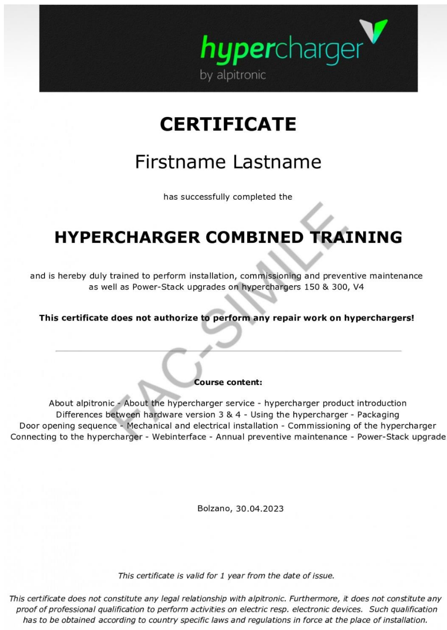
Figure 5: Sample certificate combined training