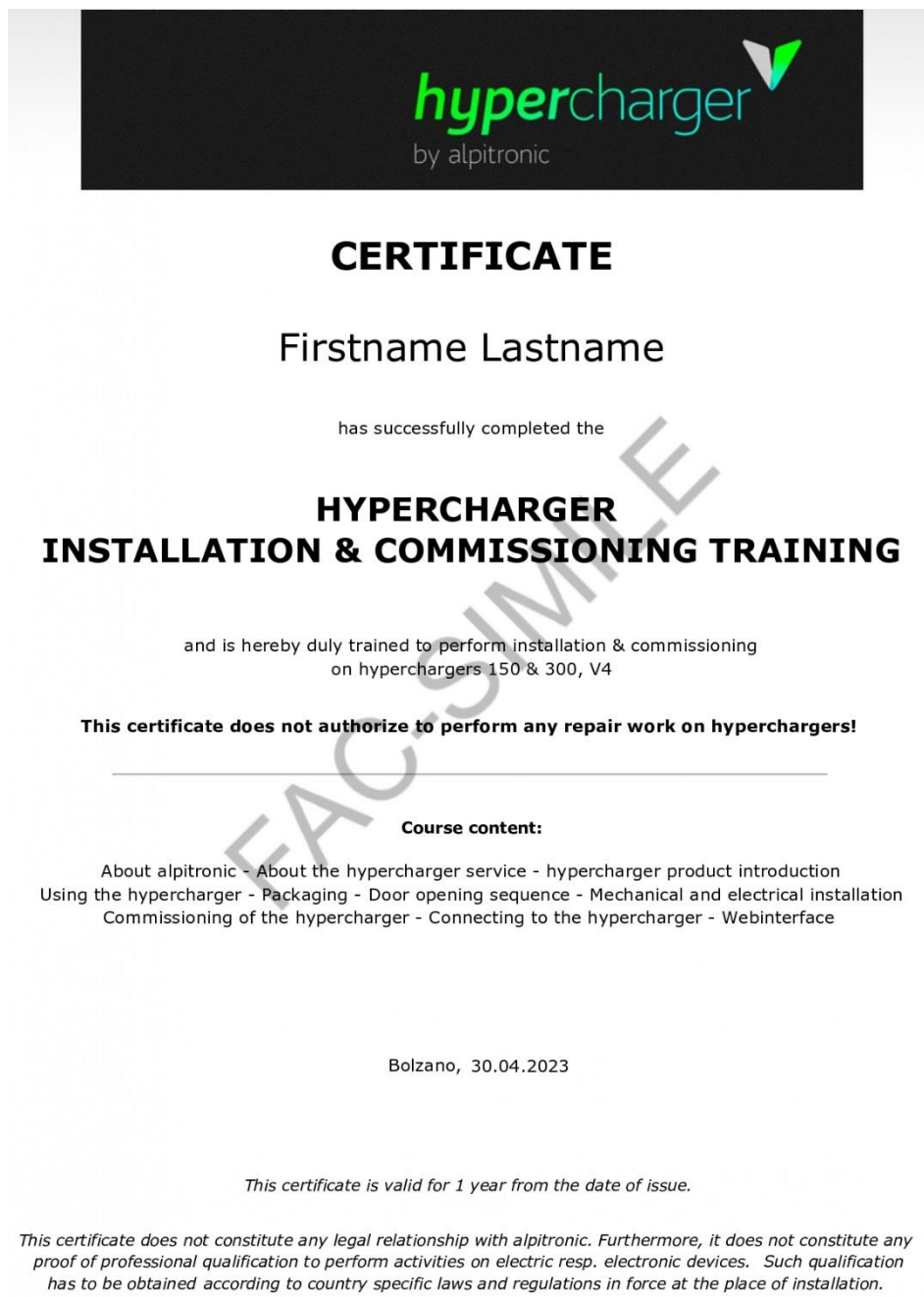
Figure 3: Sample certificate for Installation & Commissioning