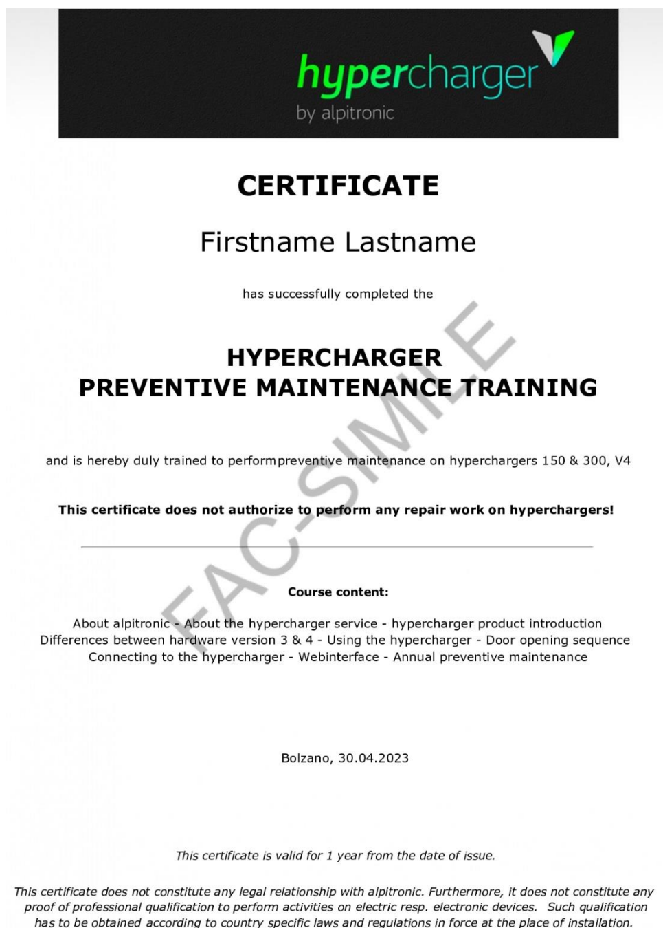
Figure 4: Sample certificate annual preventive maintenance