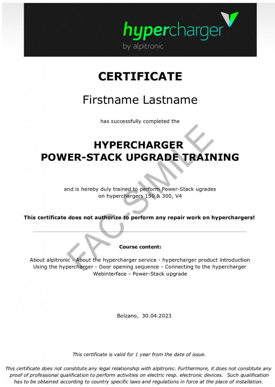
Figure 2: Sample for confirmation of attendance Power-Stack upgrade training